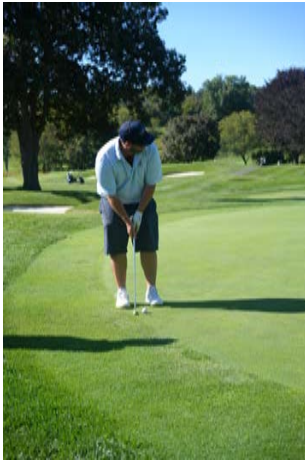
Lining up the putt!