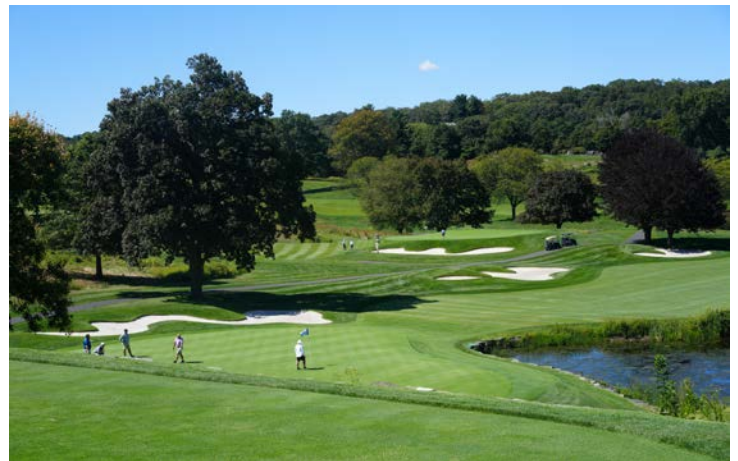
Scarsdale Golf Club.