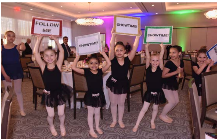
Education United students from Winfield L. Morse Elementary School, under the direction of Westchester Ballet Company.