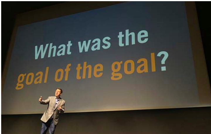
Dan Heath, best-selling author and Morning Keynote Speaker.