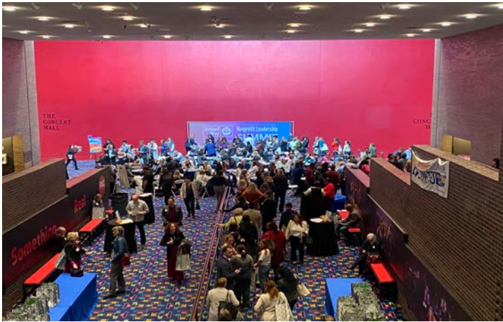
Guests arriving to the 2025 Nonprofit Leadership Summit.