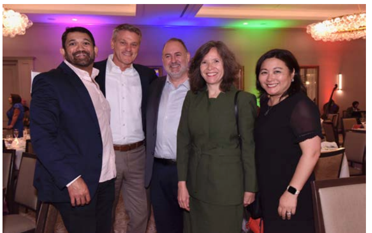
PepsiCo friends celebrate at the Imagine Gala.