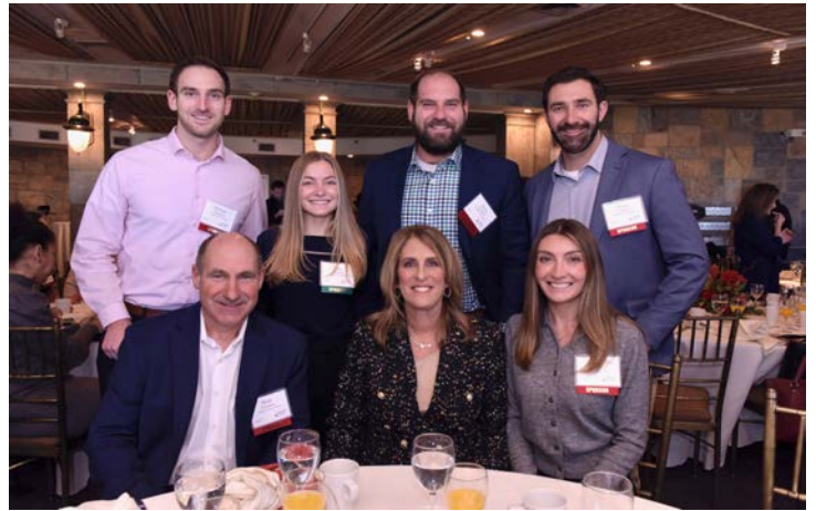
The Tompkins Family.